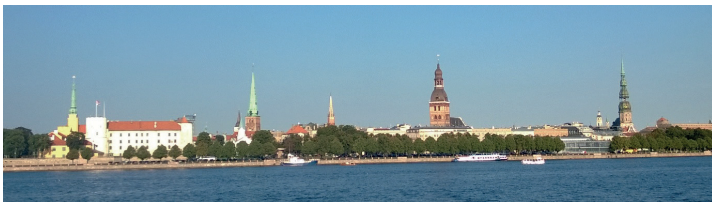
Riga from the River Daugava